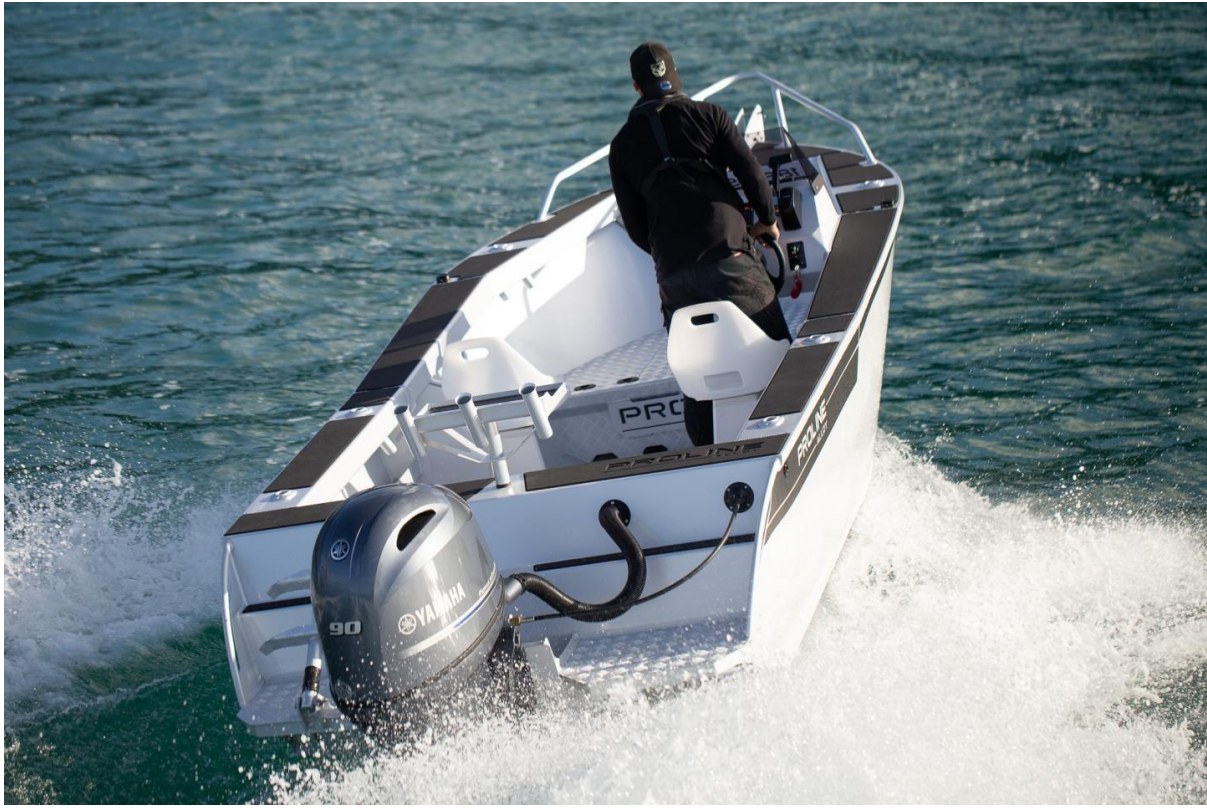
Proline Alloy 1860 SC