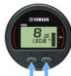
DOWN UP Variable trolling switch